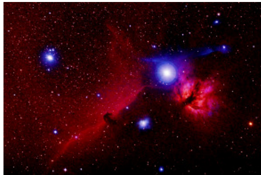
NGC2024 — Flame Nebula IC434—Horse Head Nebula

Be sure to follow our special events like the Messier Marathon, Tuzigoot Star Night, Night Under the Stars at Alamo Lake & Star Night at Red Rock State Park