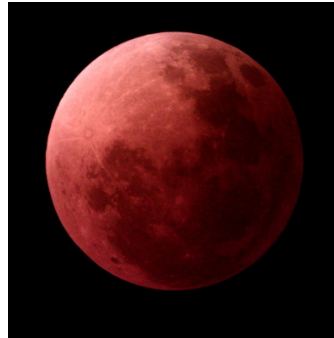
Verde Valley Total Lunar Eclipse November 8th, 2022

Membership is open to anyone that has an interest in or a desire to learn more about astronomy. Family membership dues are $20.00 per year. Membership entitles the member and their family to attend special club events, dark sky observing sessions, star parties and any other special activities sponsored by the club.